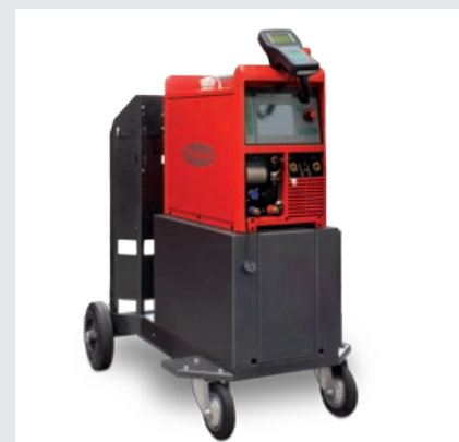
/ Carriage PickUp (accessory)