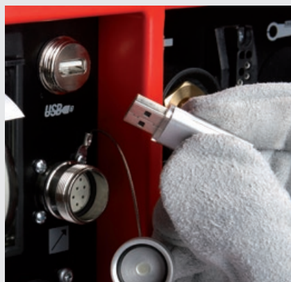
/ USB interface