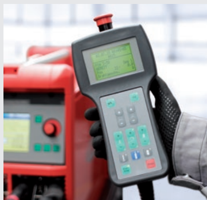
/ Remote control FRC-FPA 3020